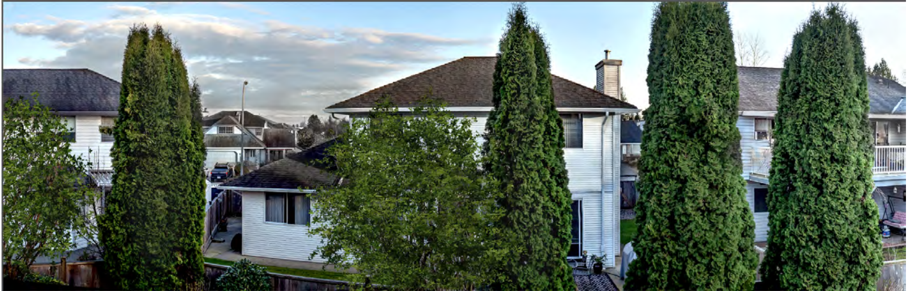
* Translight is printed Twilight - can be Back-Lit for Brighter for Day or Darker for Night